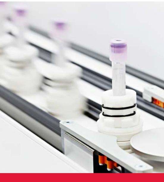
Gentle handling of delicate products as blisters, bottles, syringes or ampoules reduces the waste.

Increasing demands on secondary packaging and producing smaller batches makes versatility more critical than ever. We supply complete product handling capabilities throughout the production process, including pick-and-place and palletizing.